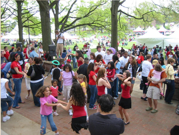
People dancing to the rhythms of Latin America

The Latin American Studies Center and the School of Spanish and Portuguese once again had an outstanding participation on MARYLAND DAY on Saturday, April 28 2007. Just like every year, the booth was located at the front steps of the Holzapfel Hall, and gave the opportunity to all visitants to explore Latin American and Caribbean culture through trivia games, dance, music and fun!