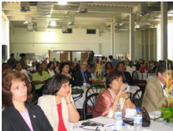
Participants from 25 different countries attended the seminar

Another component of the seminar was the discussion groups that addressed strategies and opportunities for professional development of teacher educators. Presenters and participants looked at institutional and conceptual models of teacher education and strategies for institutional program development. Five thematic discussion groups were formed from suggestions and questions from the prior day: Philosophy of teacher education; Professional development of teacher education; Structural changes for teacher education; Empowerment of teacher education; and the structure of the profession: the case of Trinidad and Tobago. Finally, Dr. Carol Anne Spreen (UMD) facili-