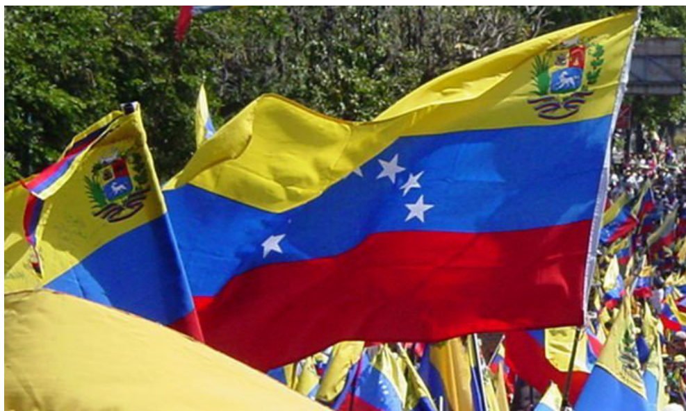
Venezuelans take the Capital's streets to express their political views